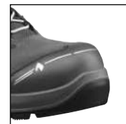
HAIX® Nano-Carbon Toe Cap